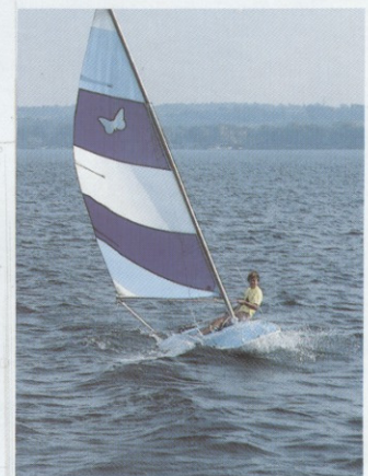
Two-piece mast rotates for proper bend and perfect air foil.